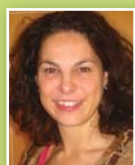
DR DAVINA WHITE

Dr Clarke is a postdoctoral researcher developing satellite image-based tools to monitor soil erosion risk in southern Australian agricultural lands.