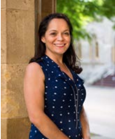
Aboriginal and Torres Strait Islander student guide

Postgraduate research students are supported by Wirltu Yarlur to connect them with world-renowned research centres and researchers. Student Support Officers also provide tailored academic and cultural supports. For more information please contact the Adelaide Graduate Centre, or Wirltu Yarlur directly.